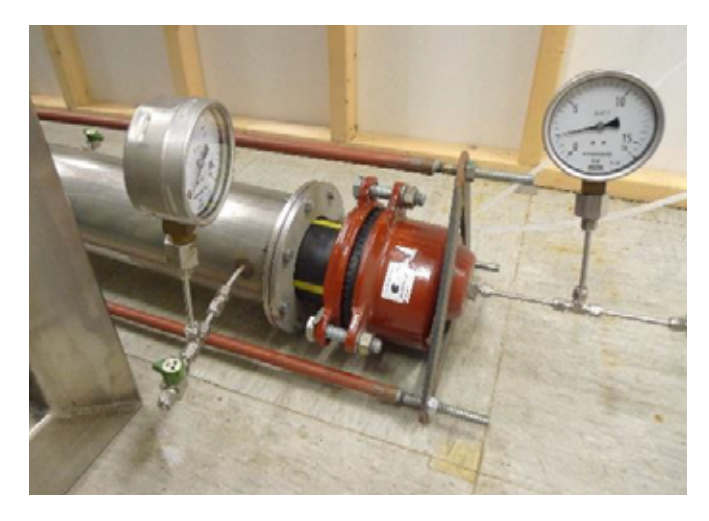
Figure 2. Permeation experimental setup in which the PE pipe (black with yellow stripes) is capped and pressurised whilst permeation is measured by gas chromatography in a stainless steel jacket pipe.

One of the strengths of HDPE piping is its ability to be repaired via electrofusion jointing. To ensure that HDPE pipe networks containing hydrogen maintain this ability, pipe sections of the same type described above were exposed to hydrogen at a pressure of 2 bar for 1,000 hours at room temperature. Subsequently, these sections were fused via an electrofusion coupler in accordance with the Dutch welding standard NTA 8828:2016. Tensile specimens were cut from the joints and then examined by visual inspection and using the peel test in accordance with ISO 13954 (Figure 1). No cavities were found in any of the test bars and the peel test resulted in ductile failure of the pipe itself rather than across the joint, indicating no detrimental effect of hydrogen on the ability of HDPE piping to be repaired after exposure to hydrogen.