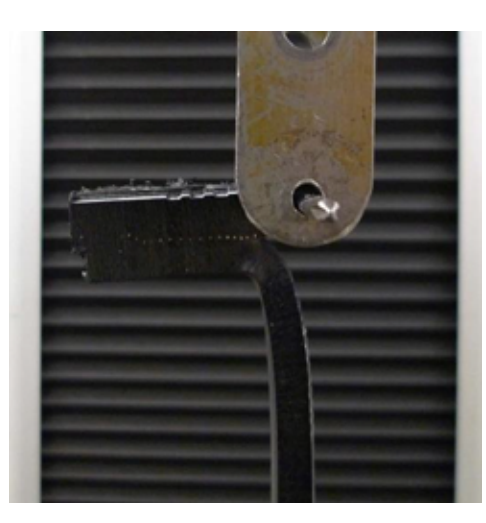
Figure 1. Peel test setup as per ISO 13954

One of the strengths of HDPE piping is its ability to be repaired via electrofusion jointing. To ensure that HDPE pipe networks containing hydrogen maintain this ability, pipe sections of the same type described above were exposed to hydrogen at a pressure of 2 bar for 1,000 hours at room temperature. Subsequently, these sections were fused via an electrofusion coupler in accordance with the Dutch welding standard NTA 8828:2016. Tensile specimens were cut from the joints and then examined by visual inspection and using the peel test in accordance with ISO 13954 (Figure 1). No cavities were found in any of the test bars and the peel test resulted in ductile failure of the pipe itself rather than across the joint, indicating no detrimental effect of hydrogen on the ability of HDPE piping to be repaired after exposure to hydrogen.